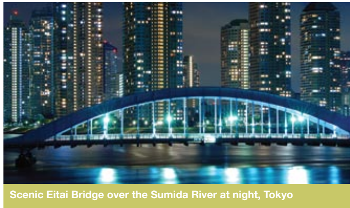
Scenic Eitai Bridge over the Sumida River at night, Tokyo