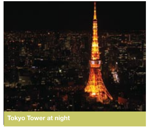
Tokyo Tower at night

Totally efficient road maintenance delivery. There was no rush, nobody was under stress but everyone was 100% utilised throughout the working day in the most perfectly balanced operation we had ever seen. The pre-planning of labour, plant and materials was meticulous. Materials arrived within 5 minutes of being needed.